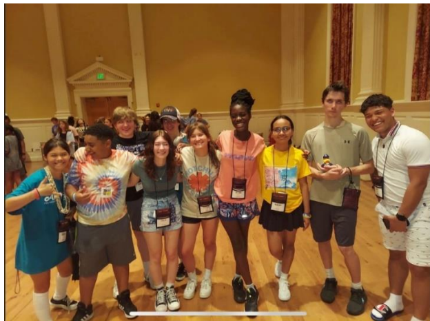
Teens attending EYE at the Univ. of Maryland